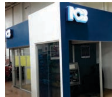
NCB Self-Served Kiosks