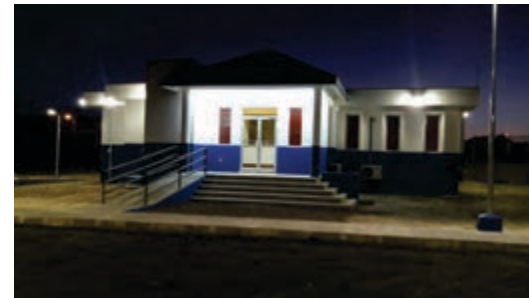
Longville Police Station