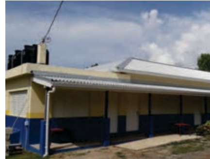
Bound Brook Infant School